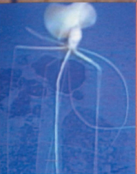
Japan Marine Science and Technology Center

↑ On November 7, the supersonic Concorde airplane flies for the first time since the July 2000 crash that killed 113 people. Flight F002 travels from Paris to New York in just under four hours.